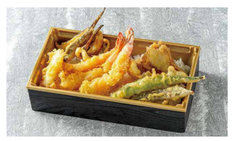
Seasonal Rice Bowl with Tempura (with Cup Salad) 17:30-19:30 L.O. ¥2,000