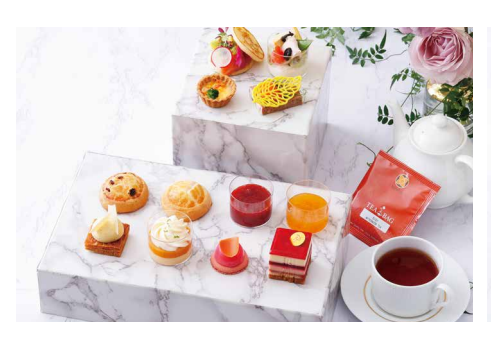
JARDIN DE FLEUR with Pierre Hermé Paris Afternoon Tea Box

April 1st-June 30th (per person) ~~43,996