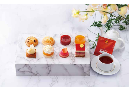
JARDIN DE FLEUR with Pierre Hermé Paris Petit Four Box

April 1st-June 30th (per person) ~~43,996