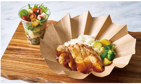
Crispy Chicken Lunch Box (with Cup Salad) 11:00 -14:00 L.O. ¥1,300