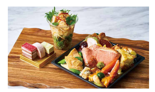
Buffet Style Bento Box 11:00 -14:00 L.O. ¥2,000 / 17:30 -19:30 L.O. ¥3,000 * Customers can choose what they prefer from buffet restaurant to make their own takeout box.