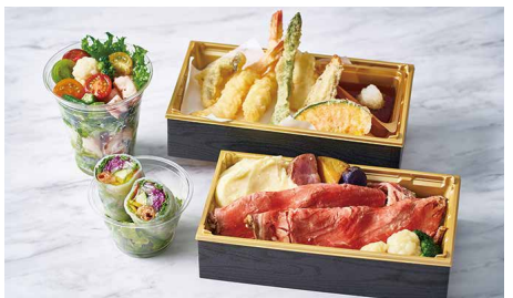
Chef's Live Kitchen Party Set 17:30-19:30 L.O. ¥3,600