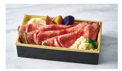
Roast Beef 200g 17:30-19:30 L.O. ¥3,000