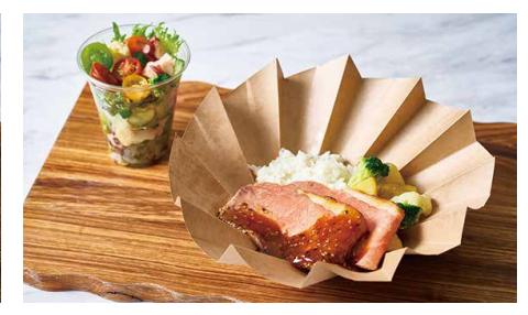
Roast Beef Rice Bowl (with Cup Salad) 17:30-19:30 L.O. ¥2,800