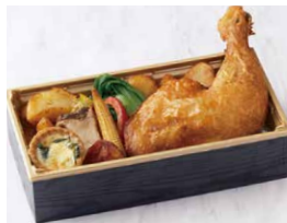
Confit Chicken Leg and Assorted Appetizers