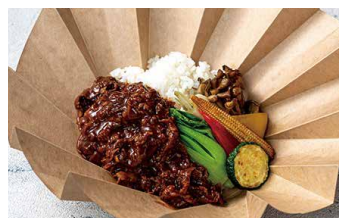
Hashed Beef with Rice ¥3,200