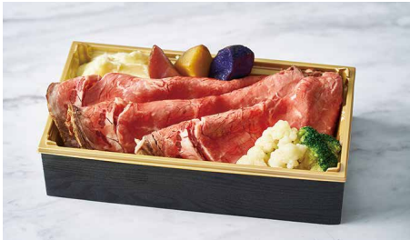
Roast Beef 200g