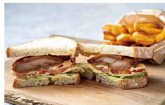
Teriyaki Chicken Sandwich ¥3,080