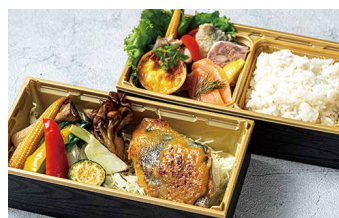
Grilled Spanish Mackerel Bento Box ¥3,190