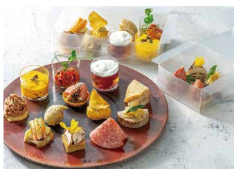
12 Kinds of Assorted Appetizer Plate