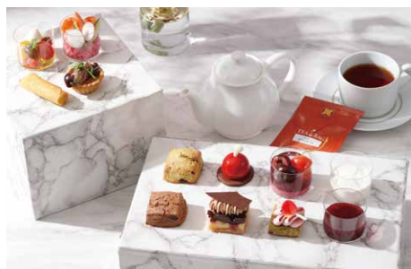
Cherry Afternoon Tea with Lindt Chocolate Box 8 May – 30 June (per person) ¥3,996