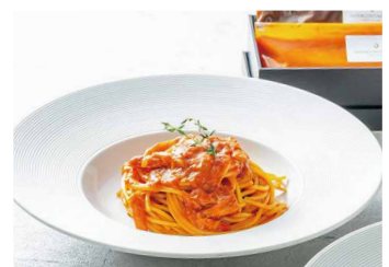
Tomato Cream Sauce with Snow Crab and Lobster (for 2 people)

(Dried spaghetti for 2 people. +¥300) ¥2,100