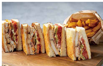
Clubhouse Sandwich ¥3,300