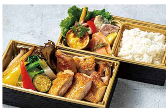
Shingen Chicken Bento Box ¥3,520