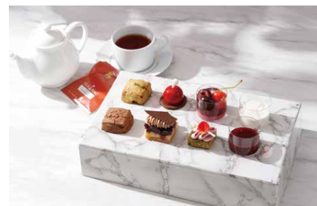
Cherry Afternoon Tea with Lindt Chocolate Petit-four Box 8 May – 30 June (per person) ¥3,456

*Weekdays: Order by 12:00 PM on the day / Pickup by 6:00 PM Weekends and Public holidays: Order by 12:00 PM the day before / Pickup by 6:00 PM