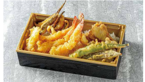
Seasonal Rice Bowl with Tempura (with Cup Salad)