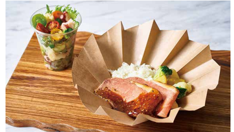
Roast Beef Rice Bowl (with Cup Salad)