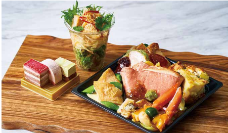
Buffet Style Bento Box

Chef's Live Kitchen 11:00-14:00 L.O. | 17:30-19:30 L.O.