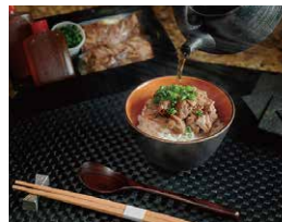
Green Tea over Rice with Beef Tendon Topping