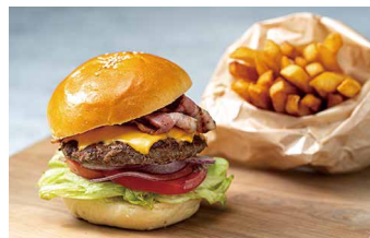
B.L.T Cheese Burger ¥3,300