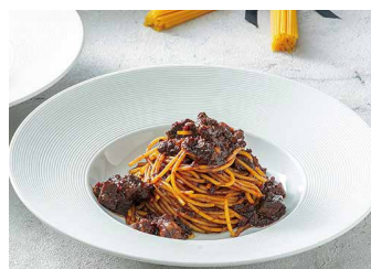
Beef Cheek Bolognese Sauce (for 2 people)

(Dried spaghetti for 2 people. +¥300) ¥2,100