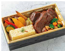
Stewed Beef Tongue with Butter Rice