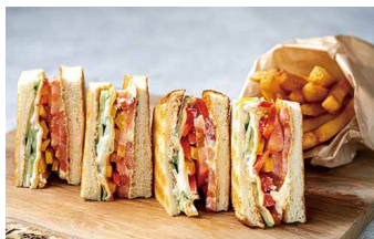
Vegetable Sandwich ¥2,860