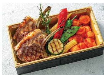
Grilled Lamb Rack (2 pieces)