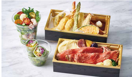
Chef's Live Kitchen Party Set