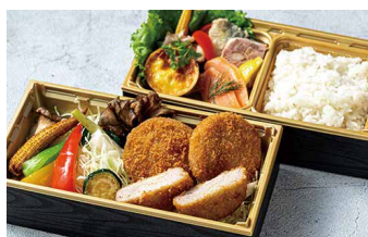
Pork Fillet Cutlet Bento Box ¥3,520