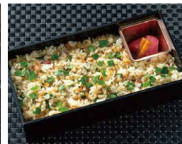
TAKUMI Special Shirasu Rice (for 2 people)