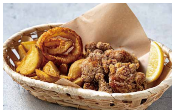
Fried Chicken, French Fries and Onion Rings ¥1,400