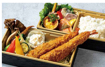
Fried Prawn Bento Box ¥3,300