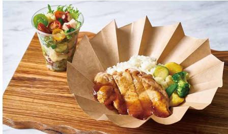
Crispy Chicken Lunch Box (with Cup Salad)

* Customers can choose what they prefer from buffet restaurant to make their own takeout box.