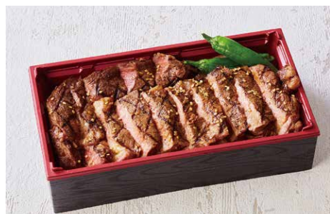
Steak Rice Box from Teppanyaki TAKUMI Standard ¥3,564 / Upgraded ¥5,400