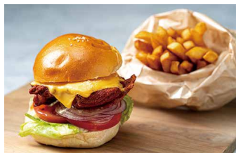
Tandoori Chicken Burger ¥2,300