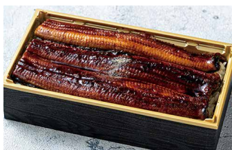
Premium Mikawa Eel Rice Box ¥10,000