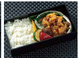
Teppanyaki Grilled Abalone with Rice