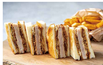
Pork Cutlet Sandwich ¥3,080