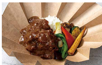
Braised Beef Cheeks with Rice ¥2,700